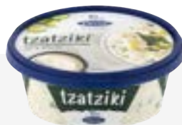
20g Chris' Tzatziki Dip 19 kcal