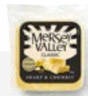
25g Mersey Valley Classic Cheese 101 kcal