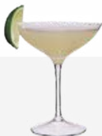
Frozen Margarita 218 kcal