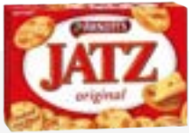
25g Jatz Crackers (Approx. 6 biscuits) 117 kcal