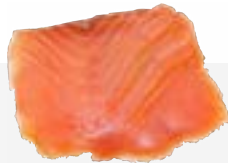
Woolworths Fresh Sliced Smoked Salmon 152 kcal