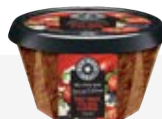
20g Red Rock Deli Tomato, Feta, Basil & Cashew Dip 56 kcal