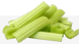
25g Celery Sicks 4 kcal