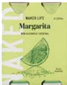
Naked Life Margarita 5 kcal