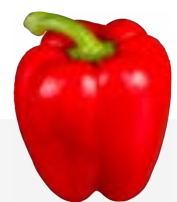
Fresh Capsicum 27 kcal