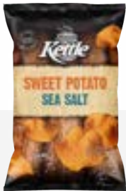
25g Kettle Sweet Potato Chips 132 kcal