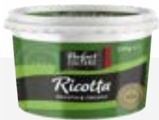
100g Perfect Italiano Ricotta 137 kcal