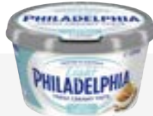
25g Philadelphia Light Cream Cheese Spread 43 kcal