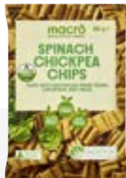
23g Macro Spinach Chickpea Chips (Approx. 11 Chips) 105 kcal