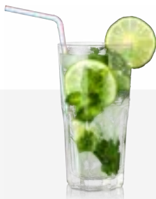
Mojito 217 kcal