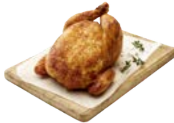
150g Woolworths Hot Roast Chicken 311 kcal