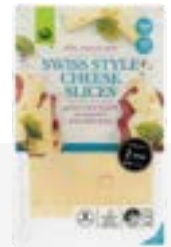
20g Woolworths Swiss Style Cheese Slices 69 kcal