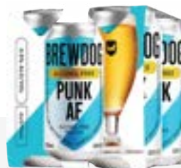
Brewdog Alcohol Free Pale Ale 45 kcal