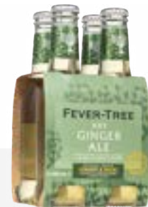
Fever-Tree Premium Dry Ginger Ale 66 kcal