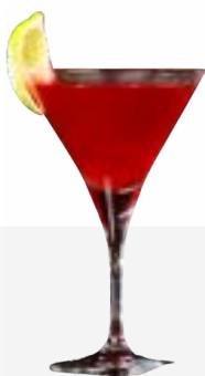
Cosmopolitan 331 kcal