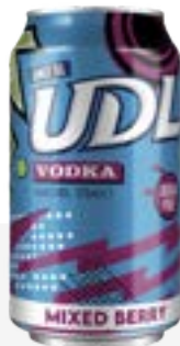
UDL Vodka 206 kcal