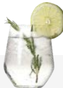
30mL Gin & 250mL Tonic 159 kcal