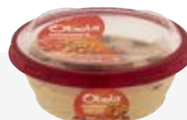
20g Obela Hommus Dip with Roasted Pinenut 53 kcal