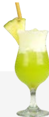
Midori Spice 370 kcal