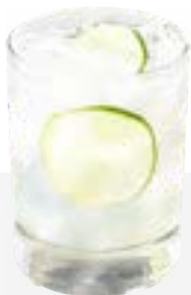
30mL Vodka & 250mL Lemonade 177 kcal