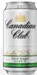
CC & Dry (Zero Sugar) 102 kcal