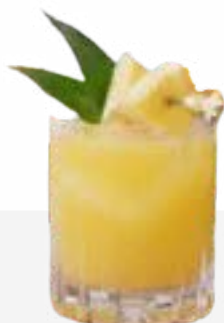
30mL Vodka & 250mL Pineapple Juice 180 kcal