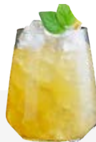
30mL Tequila & 250mL Pineapple Juice 186 kcal