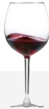
150mL Red Wine 119 kcal