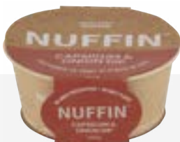
20g Nuffin Capsicum & Onion Dip 73 kcal