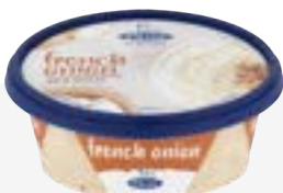
20g Chris' French Onion Dip 43 kcal