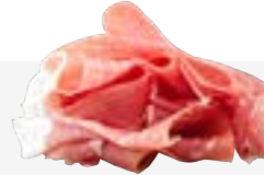
Primo Deli Prosciutto 251 kcal