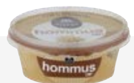
20g Willow Farm Hommus Dip 33 kcal