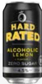
Hard Rated Zero Sugar 101 kcal