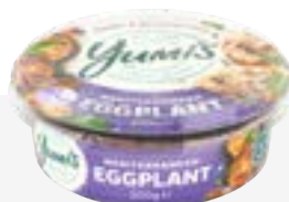
20g Yumi's Eggplant Dip 29 kcal