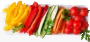
100g Mixed Veggies 20 kcal