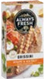
14g Always Fresh Bread Sticks (Approx. 2 Breadsticks) 63 kcal