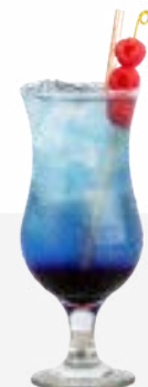
Fruit Tingle 256 kcal