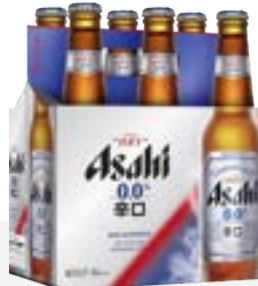
Asahi Super Dry 0% Beer 84 kcal