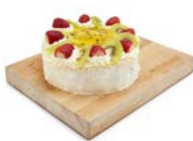
65g Woolworths Decorated Pavlova 174 kcal