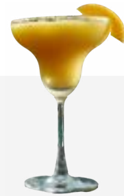
Mango Daiquiri 215 kcal