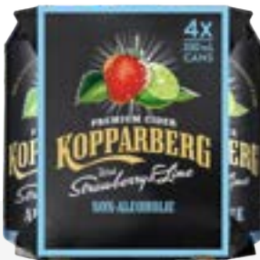
Kopparberg Non Alcoholic Strawberry & Lime Cider 137 kcal