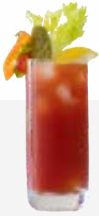
Bloody Mary 123 kcal