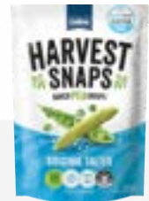
20g Calbee Original Harvest Snaps 85 kcal