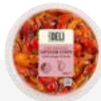
Coles Deli Roasted Capsicum Strips 182 kcal