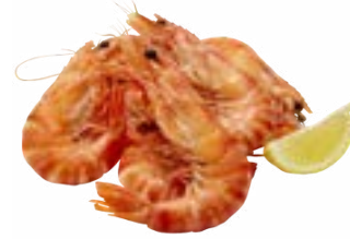
100g Coles Cooked Tiger Prawns 95 kcal