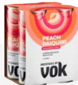
Vok Peach Daiquiri 88 kcal