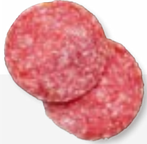
Woolworths Deli Danish Style Salami 414 kcal