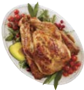
150g Ingham's Roast Turkey 136 kcal