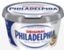
25g Philadelphia Cream Cheese Spread 56 kcal