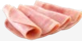
D'Orsogna Deli Champagne Leg Ham 98 kcal