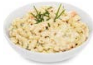
100g Woolworths Creamy Pasta Salad 251 kcal