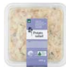
133g Woolworths Creamy Potato Salad 158 kcal

Classic Christmas lunches can come with all kinds of calorie loads. Being aware of what's on your plate helps you enjoy the foods you love and make room for the ones that matter most to you.