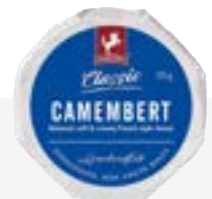
25g Unicorn Classic Camembert Cheese 81 kcal