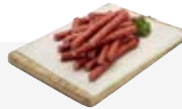
D'Orsogna Deli Tasty Sticks 320 kcal