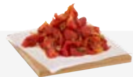
Woolworths 97% Fat Free Semi Dried Tomatoes 113 kcal