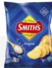
27g Smith's Original Chips (Approx. 15 Chips) 147 kcal