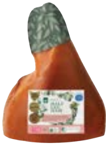
100g Woolworths Leg Ham 158 kcal