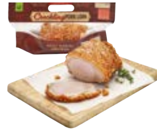
100g Woolworths Roast Pork Loin with Crackling 323 kcal