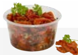
Woolworths Mediterranean Herbs Semi Dried Tomatoes 186 kcal