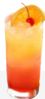
30mL Tequila & 250mL Orange Juice & Grenadine 189 kcal