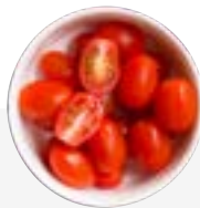
Cherry Tomatoes 22 kcal