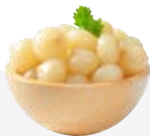
Woolworths Cocktail Onions 59 kcal