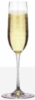
150mL Champagne 88 kcal