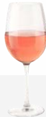
150mL Rose 124 kcal