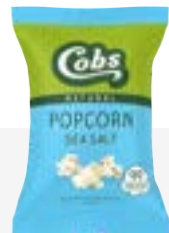
20g Cobs Salt Popcorn 99 kcal