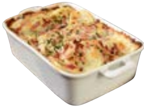
162g Woolworths Potato Bacon Bake 163 kcal