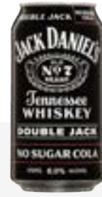
Jack Daniel's No Sugar Cola 99 kcal