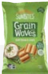
28g Sunbites Grain Waves (Approx. 12 Chips) 135 kcal