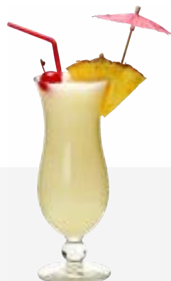
Pina Colada 340 kcal