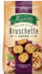
30g Maretti Bruschette Roasted Garlic Chips 136 kcal