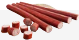
Primo Deli Cabanossi 220 kcal