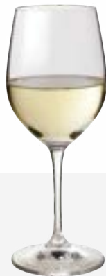
150mL Dry White Wine 108 kcal