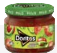
40g Doritos Mild Salsa Dip 15 kcal