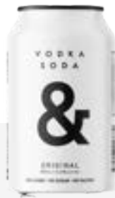
Vodka Soda & 73 kcal