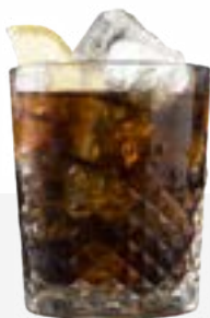
30mL Vodka & 250mL Coke No Sugar 66 kcal