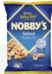
30g Nobby's Salted Peanuts 176 kcal