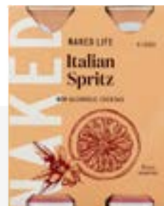
Naked Life Italian Spritz 8 kcal