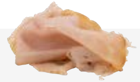
Ingham's Deli Turkey Breast 114 kcal