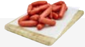
Don Deli Cocktail Frankfurts 152 kcal