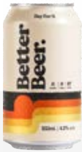
Better Beer 85 kcal