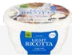
100g Woolworths Light Ricotta Cheese 101 kcal