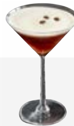
Espresso Martini 302 kcal