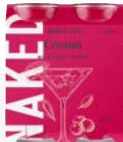
Naked Life Cosmo 6 kcal