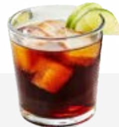
30mL Rum & 250mL Coke 173 kcal