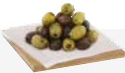
Woolworths Olives Pitted Mediterranean 194 kcal