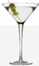
Martini 160 kcal