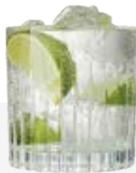
30mL Vodka & 250mL Soda with Lime 67 kcal